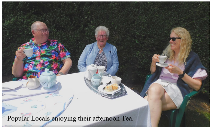
Popular Locals enjoying their afternoon Tea.