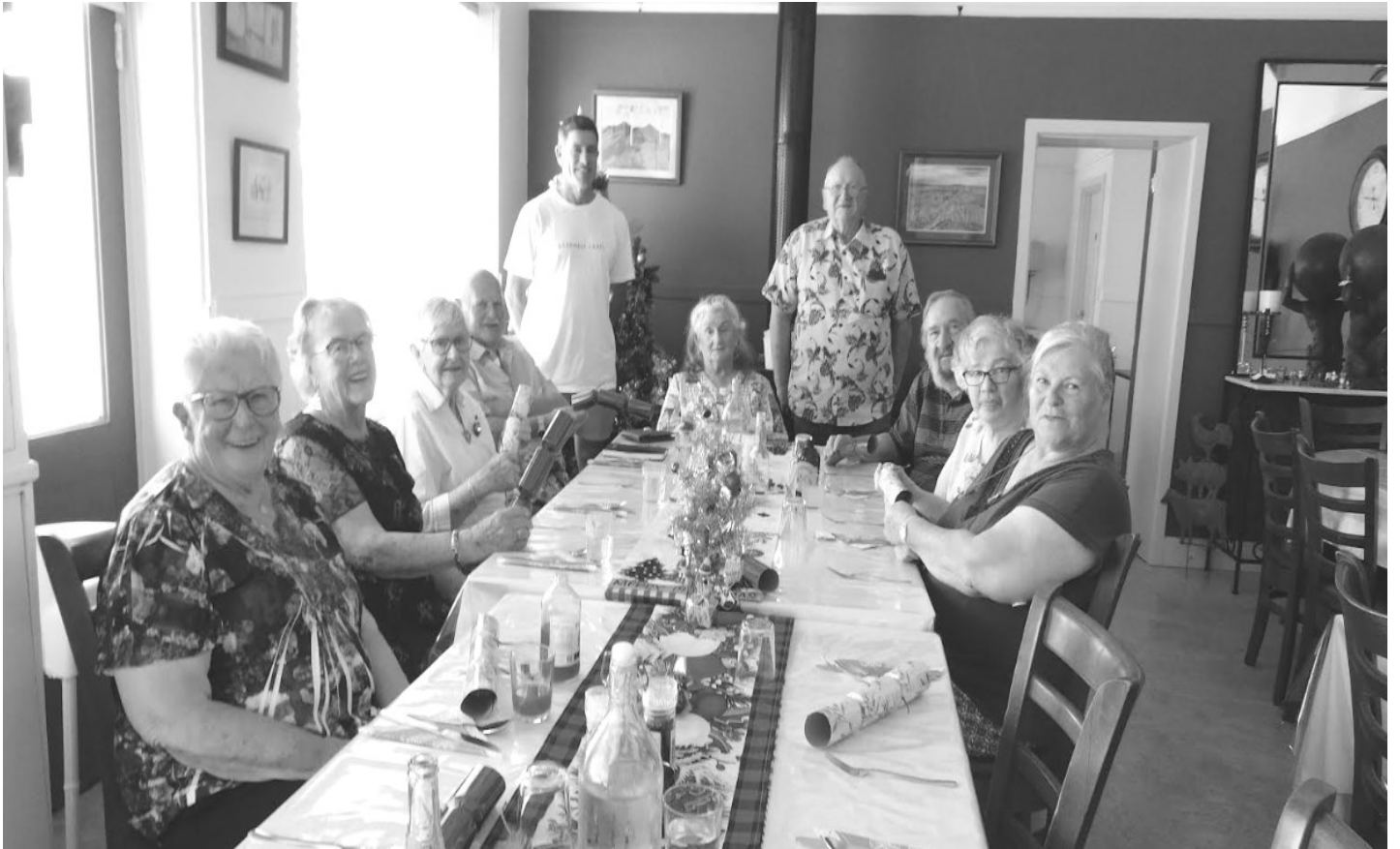
Above: Members of the Neighbourhood Wach Group, at their Christmas Break –up event at the very popular Skipton BBB Café.