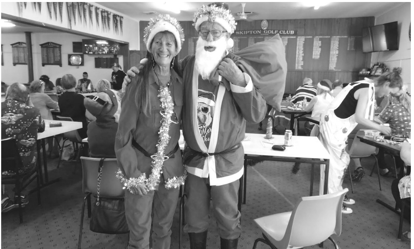
Below, Mr & Mrs Claus et the Christmas themed Bingo in the Bowling and Golf Club Rooms.