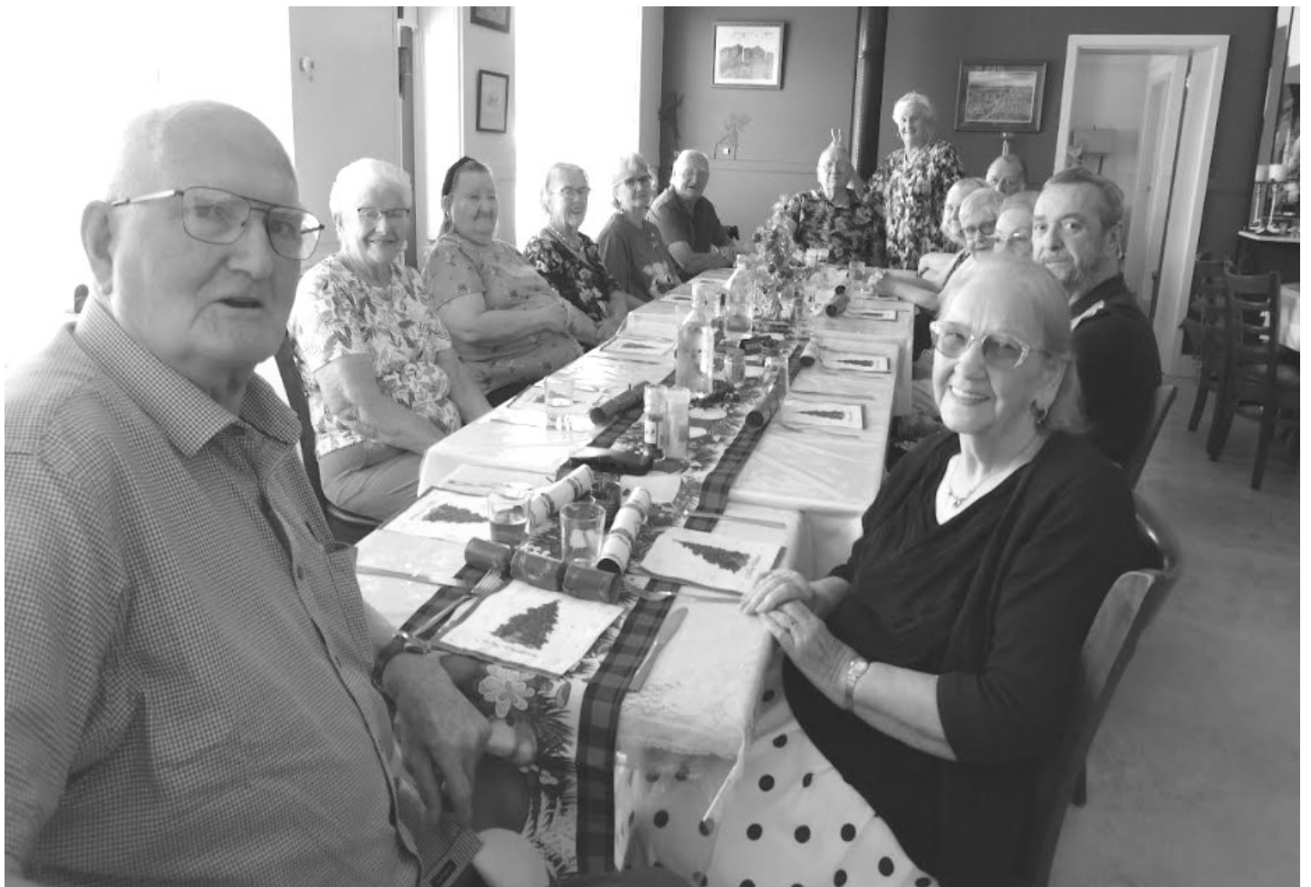
Below: Our Senior Citizens Group, ready to enjoy their Christmas event also at the Bluestone, Bubbles & Banter Café.