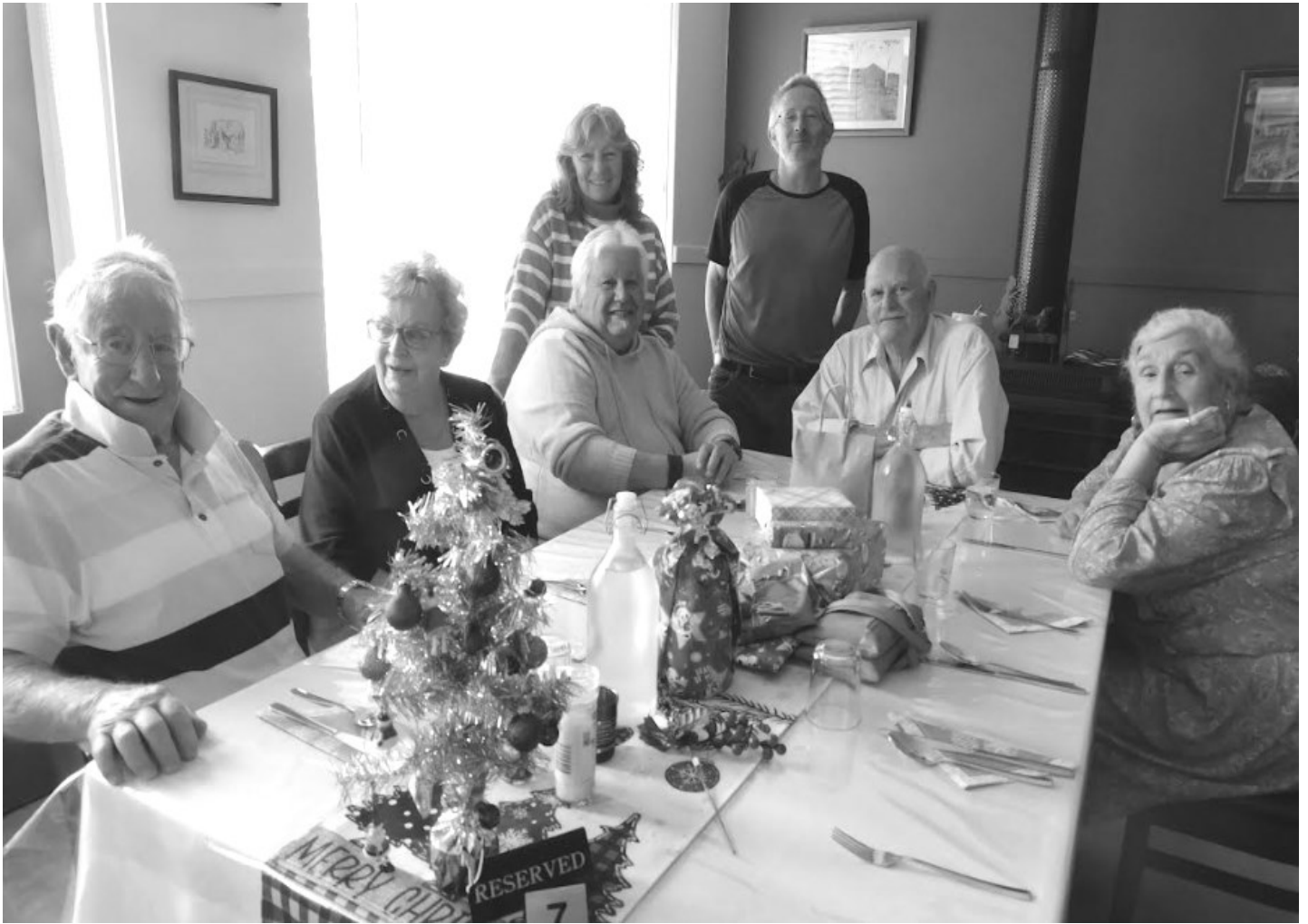
Above: Mechanics Hall members ready to enjoy their Christmas festivities at the Bluestone, Bubbles & Banter Café.