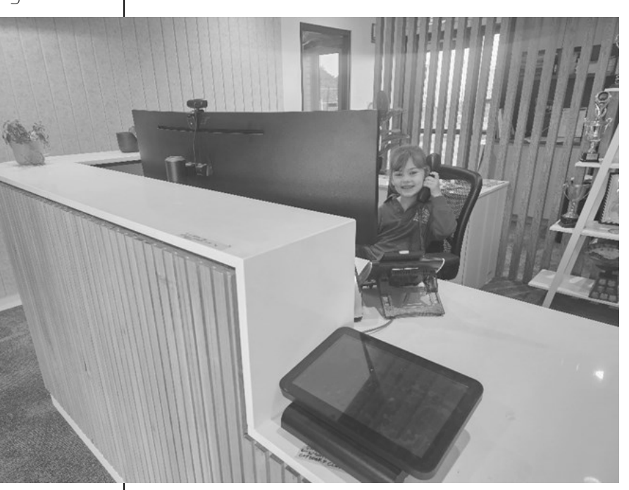
Watch Out Nat, Claudia wants your job!