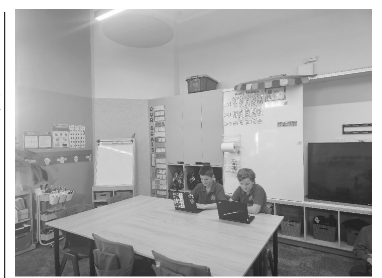
Look at these 2 cheeky faces enjoying their new space. Trying to stop themselves from giggling too hard!

School Photos will be held on Thursday the 10<sup>th</sup> of