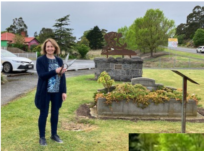
We were lucky to have had better weather and a nicer day on Thursday when these two photos were taken.

The Weekly Times reporter contacted the Committee because she wanted to put an article together, about Skipton Spring Festival, (but due to deadlines came earlier for their story), so the Committee Members assembled for her visit and photo opportunity on a bit more relaxed gathering.